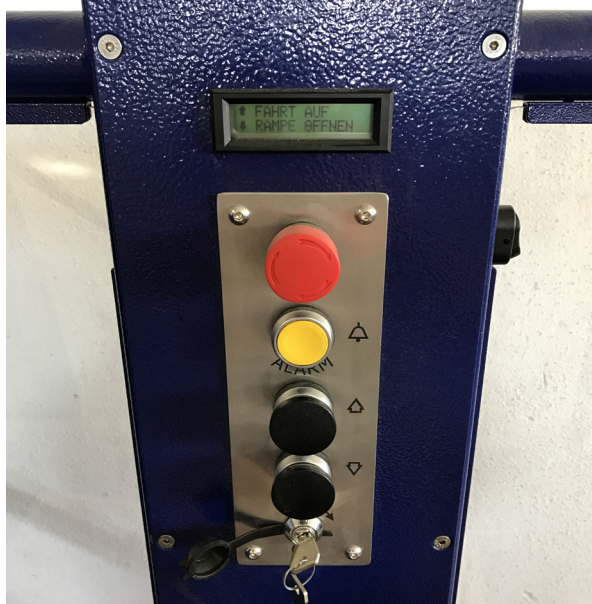
Controls on the platform with stop and alarm button, as well as a Display for status and fault indication