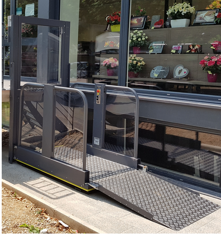
Simple access guaranteed by a long access ramp and a minimal platform height when folded

Designed for outdoor and indoor installation, 2 strong actuators in combination with a double scissor mechanism ensure a reliable and low-maintenance performance.