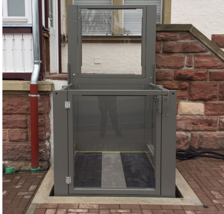
Installation in a pit with door on the platform