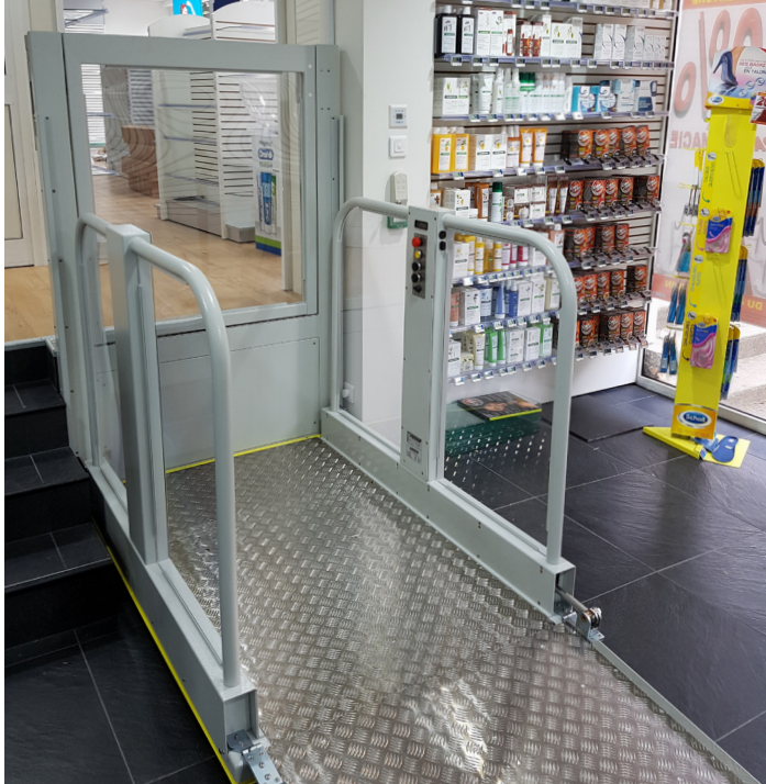
Lift can be delivered in any desired RAL colour