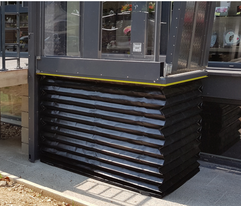
Protection covers and protection bars on all 4 sides provide for highest safety

Gates can be opened manually or automatically