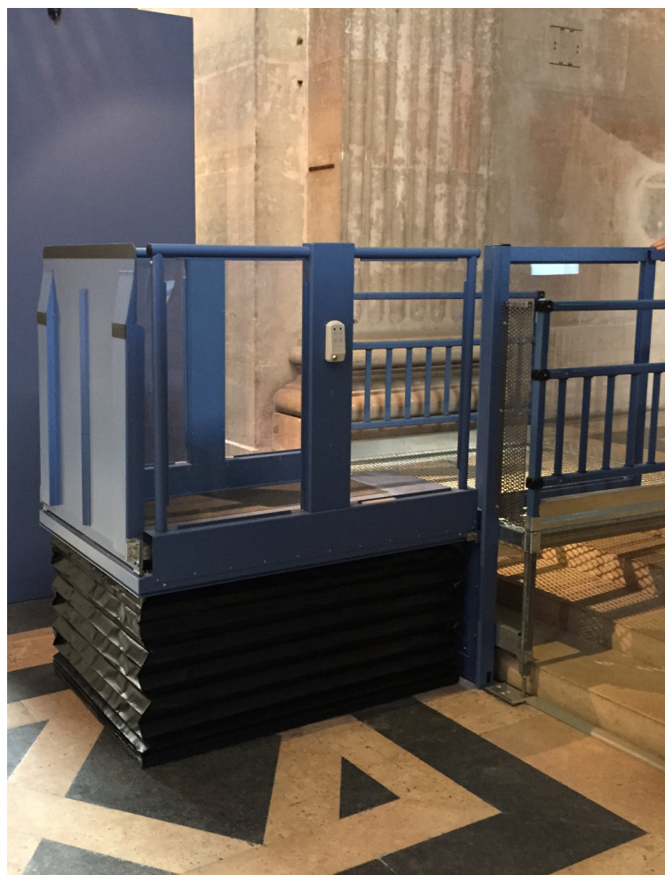
Access ramp creates a barrier at 1,1m height above the platform in line with the side walls